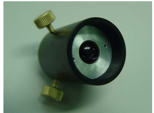
Figure 6-Focusing optic base