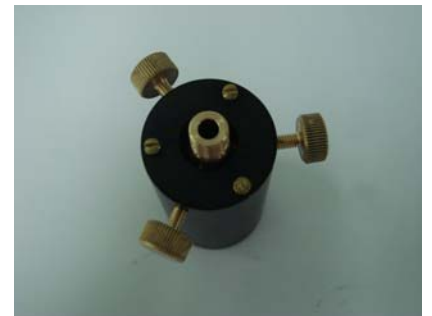
Figure 1-An optical fiber coupler

Optical Fiber couplers are optical components that are designed to allow a free - space laser beam to efficiently enter an optical fiber. Their design is simple: A focusing optic is used to reduce the beam to as small a waist as possible, and the input aperture of the optical fiber is attached at the focal point so that the largest amount of optical power possible is sent into the fiber. While there are many different kinds of fibers and fiber couplers, this guide will focus on couplers and fibers available. The four basic elements of a fiber coupler are the coupler body that attaches to the aperture of the laser module, the focusing optics located inside the fiber coupler body, and the fiber port platen held in place by three hex cap screws on coupler.