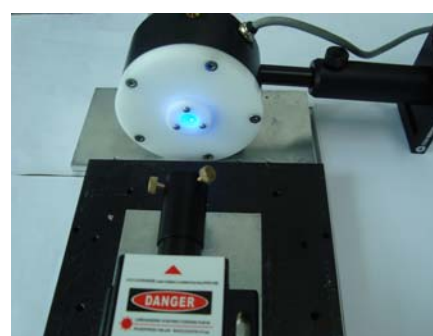
Figure 3-Laser warming up with no fiber attached

To maximize the amount of laser light entering the fiber, the coupler will need to be aligned. It aligns all fiber couplers prior to shipping, but couplers may become misaligned during shipping and when used or stored in areas with vibration or large changes in temperature. If your laser is not producing the expected level of output at the output aperture of the optical fiber, realignment may be needed.