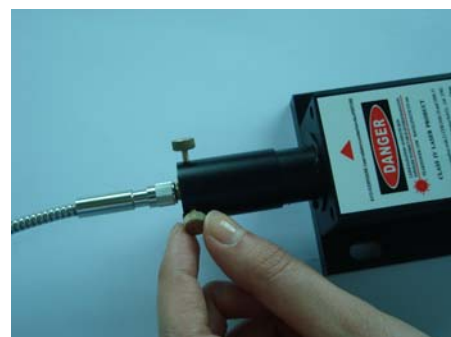
Figure 4-Checking laser output power