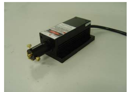
Figure 2-A 473nm laser module with optical fiber coupler attached